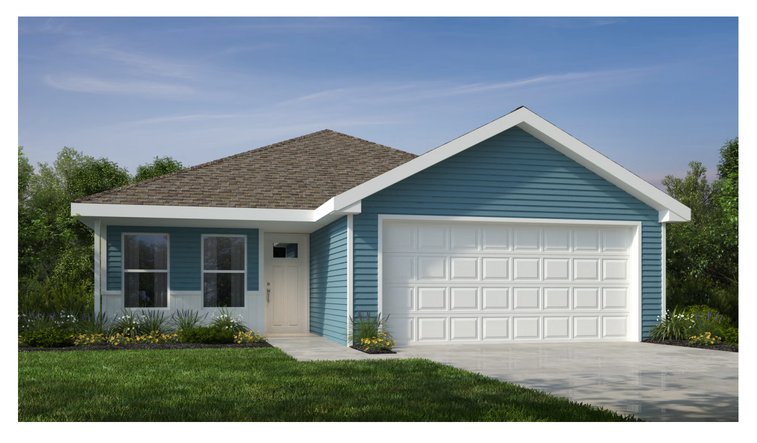
□ 3 □ 2 □ 1,165 FT<sup>2</sup>