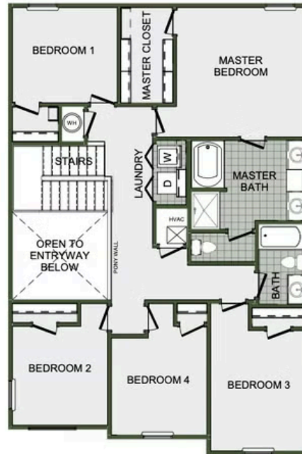
2ND FLOOR - 5 BED OPTION