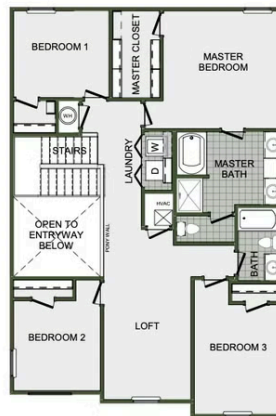
2ND FLOOR - LOFT OPTION