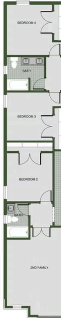
2ND LIVING ROOM