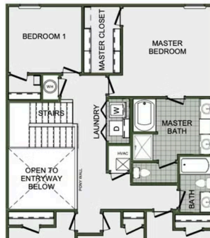
2ND FLOOR - 5 BED OPTION