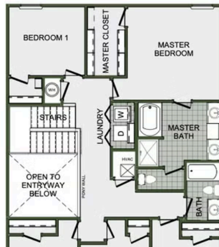
2ND FLOOR - 5 BED OPTION