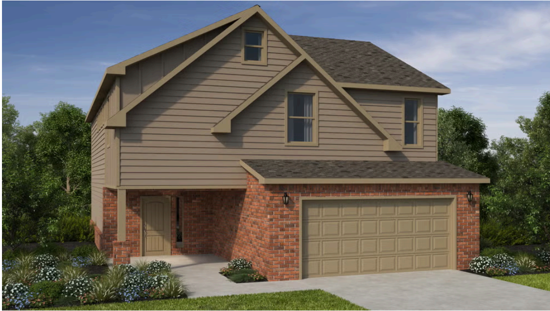
NEW LADY 3

Monday - Saturday: 10 am-6pm 417-626-7000 schubermitchell.com