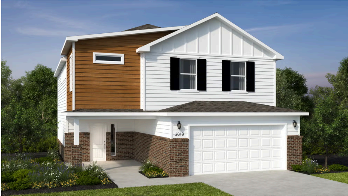
NEW LADY 1