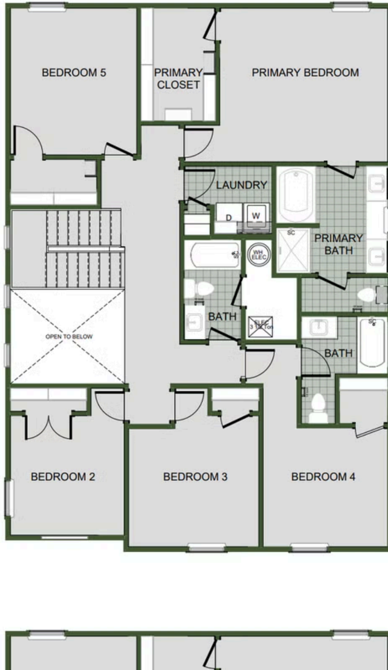
5TH BEDROOM OPTION