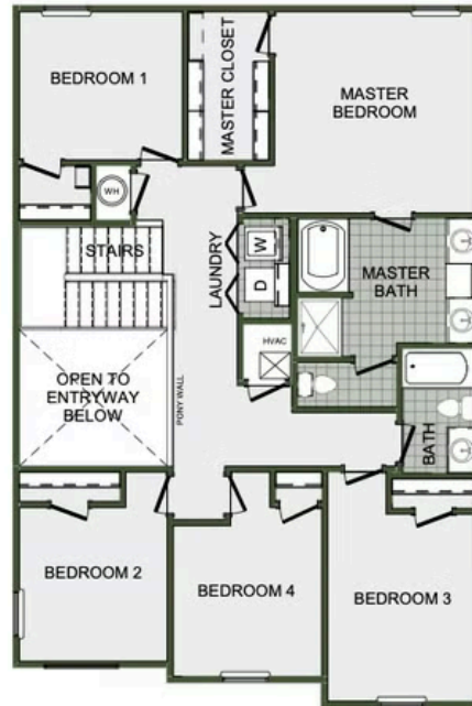
2ND FLOOR - 5 BED OPTION