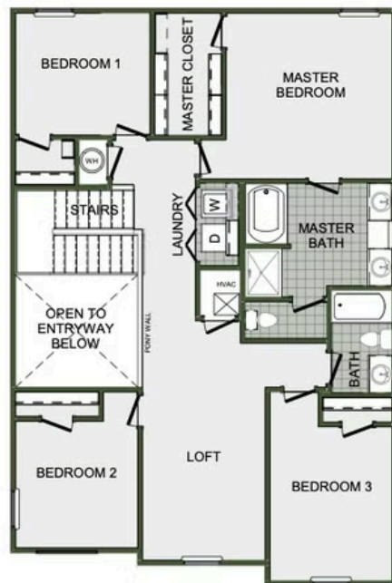
2ND FLOOR - LOFT OPTION