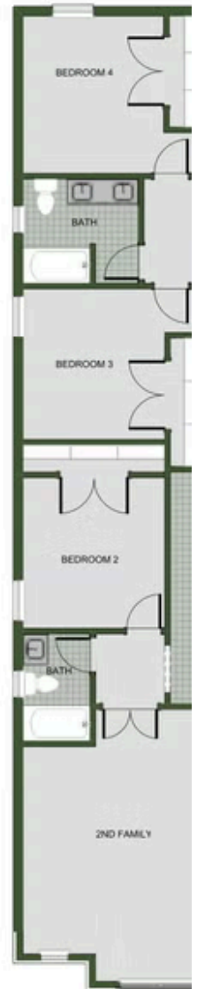
2ND LIVING ROOM